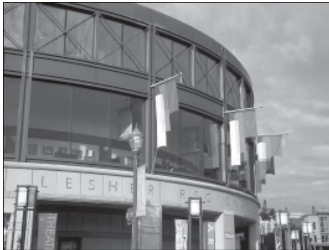
Fall 2010: The Leshner Center for the Arts 20th anniversary

Coming up in 2010: 2010 won't be a year of taking on new major projects, but we will continue to care for our existing parks, which play such an important role in our neighborhoods; replacing the