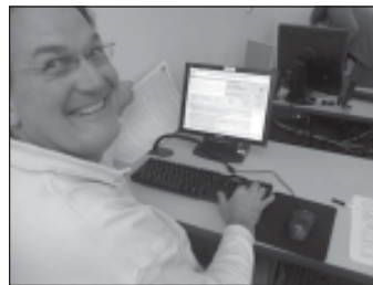
Participants logged onto a "virtual bank account" during the Community Conversations.