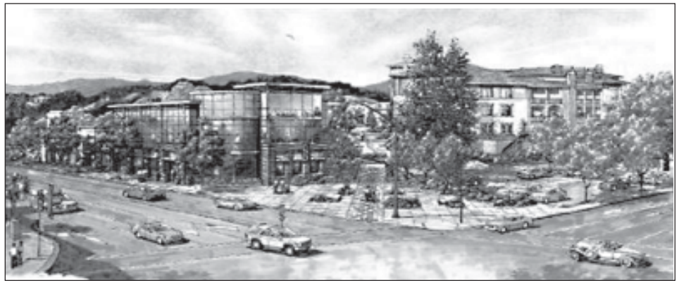
Plans for Centre Place, under construction at the corner of South California and Olympic boulevards, include improvements to the Alma Park entryway plaza.