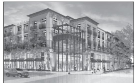
The Village at 1500 Newell, a mixed use, four-story project will include 49 condominiums and ground level retail is under review.

The health care sector is a bright spot with the expansion of John Muir Medical center, the continued success of Kaiser Permanente Medical Center and Children's Hospital East Bay's opening in Shadelands.