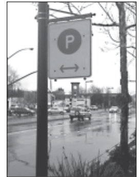
New, easier-to-read parking signs debuted over the holidays. Look for more in 2010.