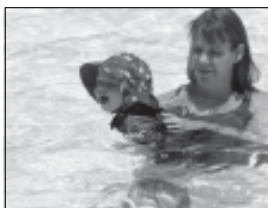
In progress: Aquatics needs assessment

2009 marked the first time in the 40-year history of Boundary Oak Golf Club that there has been a single operator for all aspects of operations. The community response has been positive, and golf rounds are up by more than 5 percent.