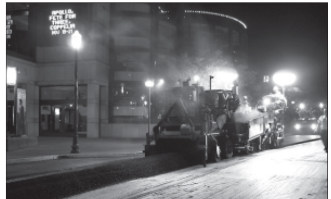
The Civic Drive rehabilitation project got a boost from Federal Economic Stimulus money.

Thanks to good advance planning of "shovel ready" projects, engineering staff seized the opportunity to receive funding from the American Recovery and Reinvestment Act to extend the length of the Civic Drive Rehabilitation Project all the way to Walden Road.