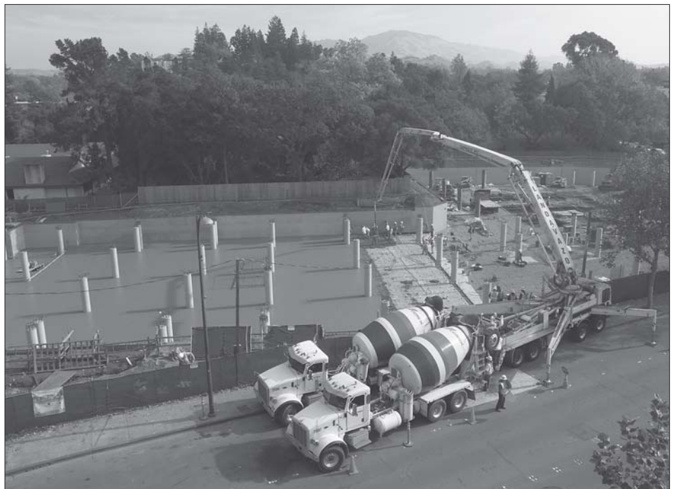
Workers poured 760 tons of fresh concrete on to the floor of the underground garage at the new downtown library on Nov. 24.

Representatives of The Cheesecake Factory expect to open the new restaurant in the coming weeks in the former Andronico's building in Plaza Escuela.