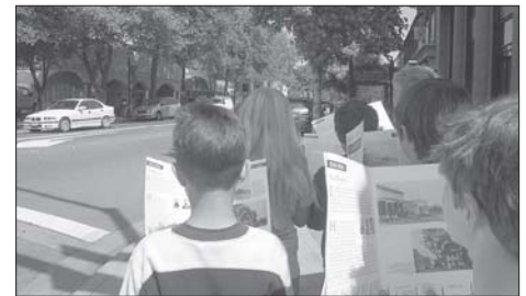
Third graders learning about historic district.

The organization is seeking applicants who have an interest in history and an aptitude for relating to children. Teaching experience is desirable but not required.